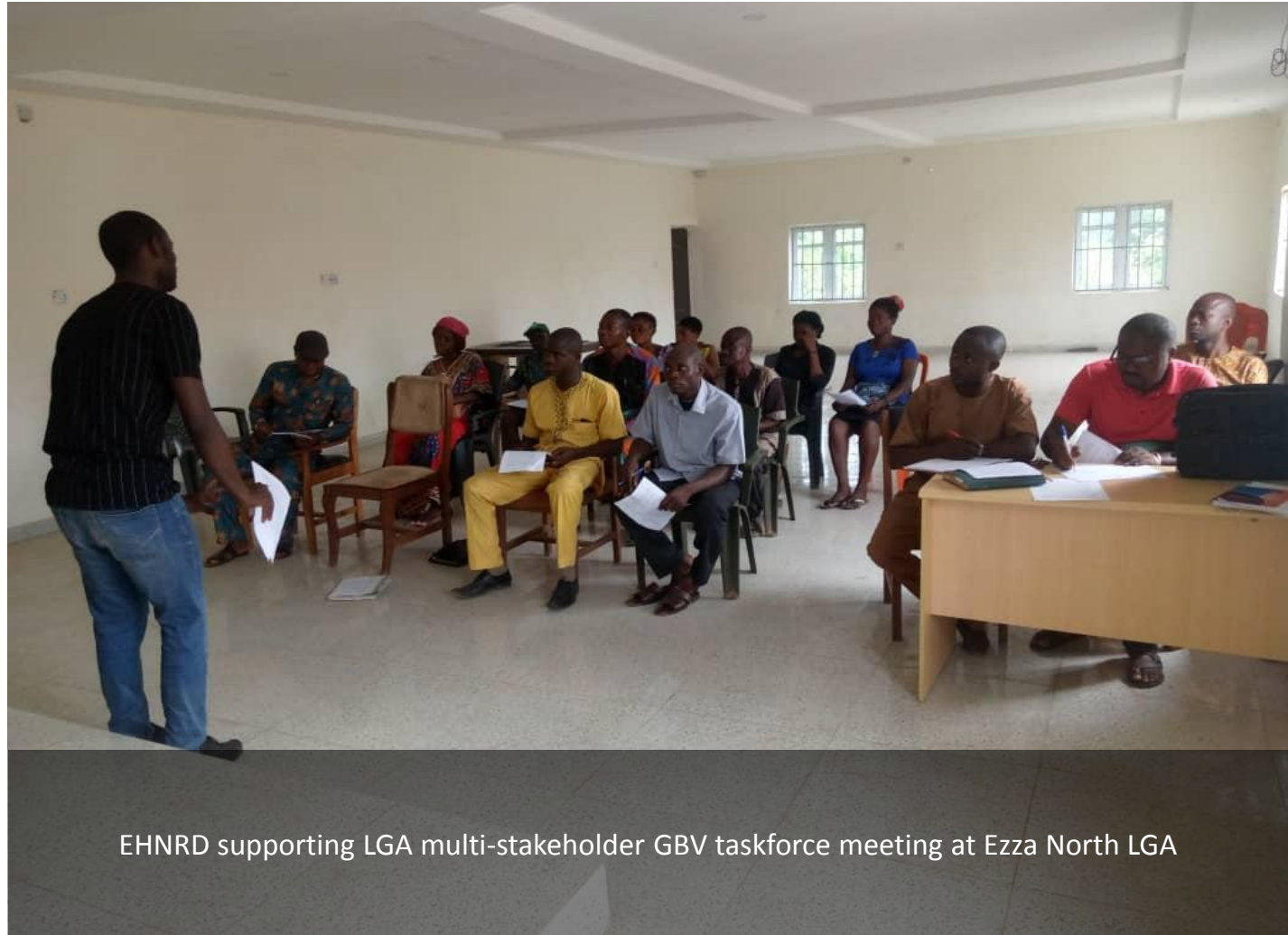
EHNRD supporting LGA multi-stakeholder GBV taskforce meeting at Ezza North LGA